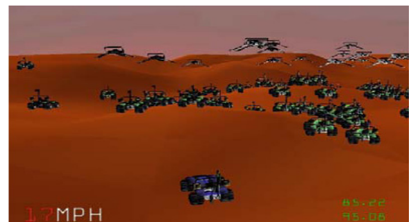
Figure 3: Mars Simulation Environment

We used NASA's 128 sample/degree data set for Mars surface (1.93GB) and 4 sample/degree data set for Moon surface. The Figure 3 is a snapshot from real-time rendering of Mars surface with 400 ground and air vehicles with 60 frames/seconds.